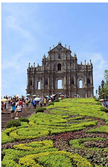
Ruins of St Paul, Macau