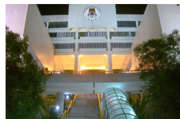
Main campus, University of Macau