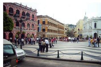
The Senado Square, Macau

We are looking forward to see you in Macau!