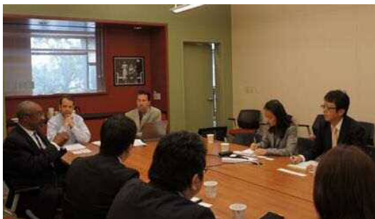
Meeting with Procurement Office

MEXT proceeds to take measures to prevent the improper use of research grants, taking into consideration the information and knowledge gained from this visit.